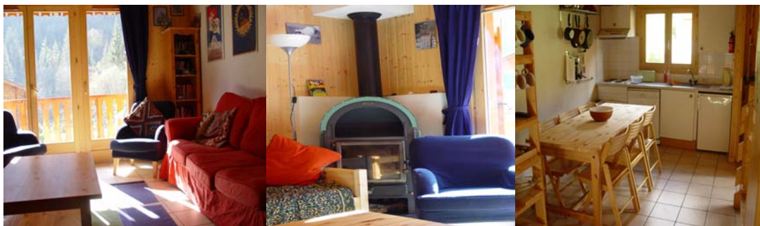
Lounge and log burner

The chalet can accommodate up to 8 people in 3 doubles and 2 bunk beds which share one of the double rooms. The lounge has an log burner fire with a sunny balcony to the front.